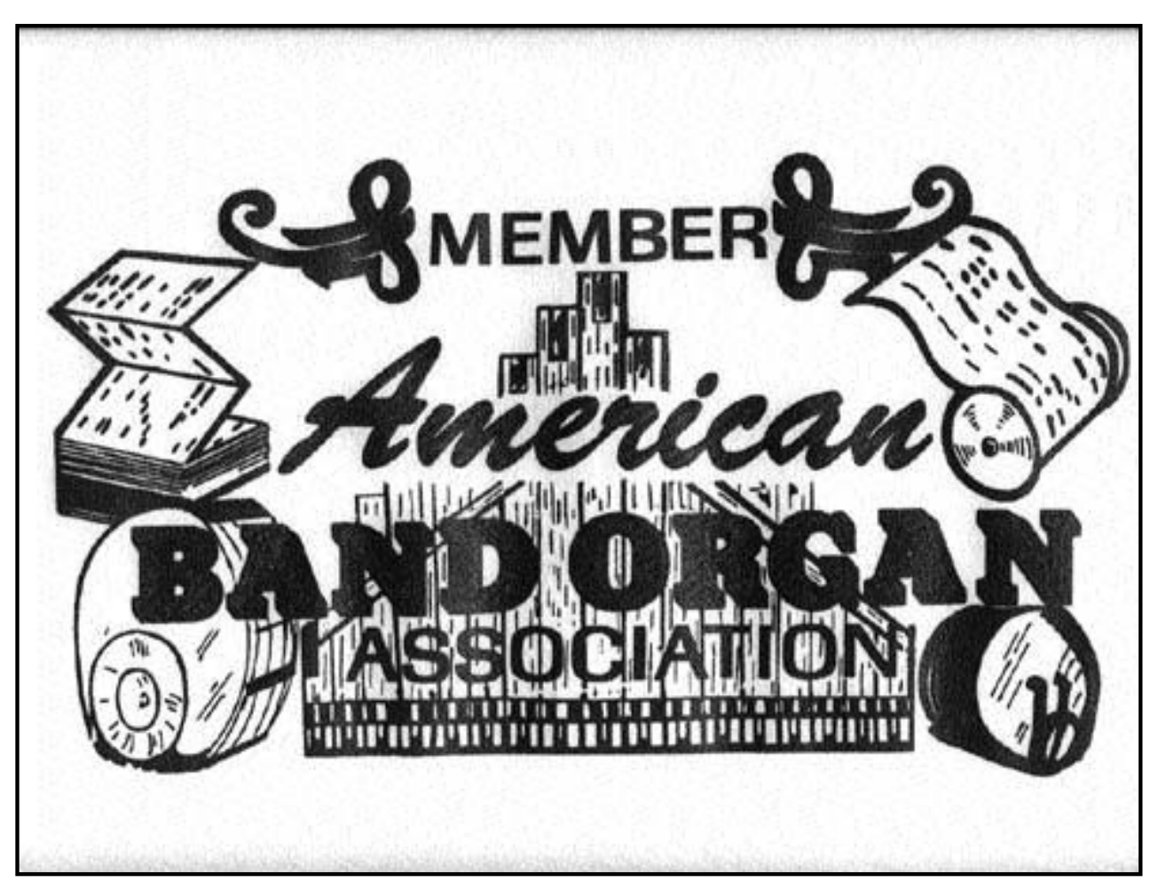
Figure 6. The membership logo, printed on a felt-like material, was passed out to members in the early years of the ABOA organization.

Recently, there has been much interest in a new organization, the Carousel Organ Association of American (COAA), a more formal group with a charter, officers, dues and a journal (a fine one, which you are looking at). The ABOA membership has smoothly assimilated into the COAA.